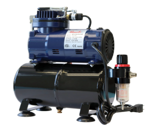
D3000R Airbrush compressor with tank

Available from: Dixie Art Airbrush • www.dixieart.com • 800-783-2612